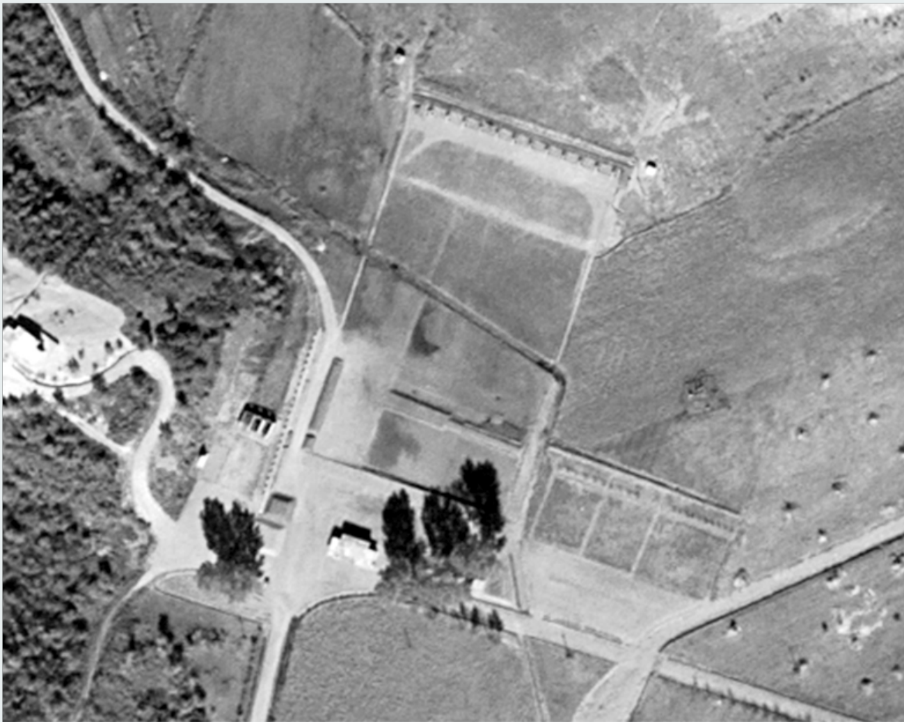
Kanggon Small Arms Firing Range, October 16th, 2014, ZPU-4 systems or targets not present.