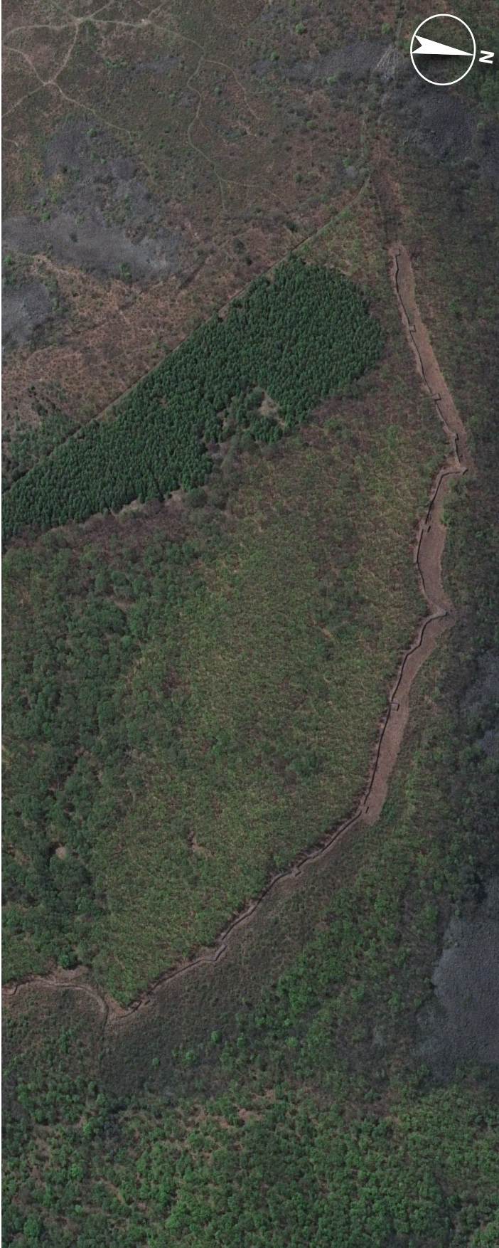
DigitalGlobe Natural Color Image, May 21, 2011, 42 27 50 N, 129 53 59 E

A possible old walled fort is inside the camp's southern perimeter, 13 kilometers south of Chungbong-dong.