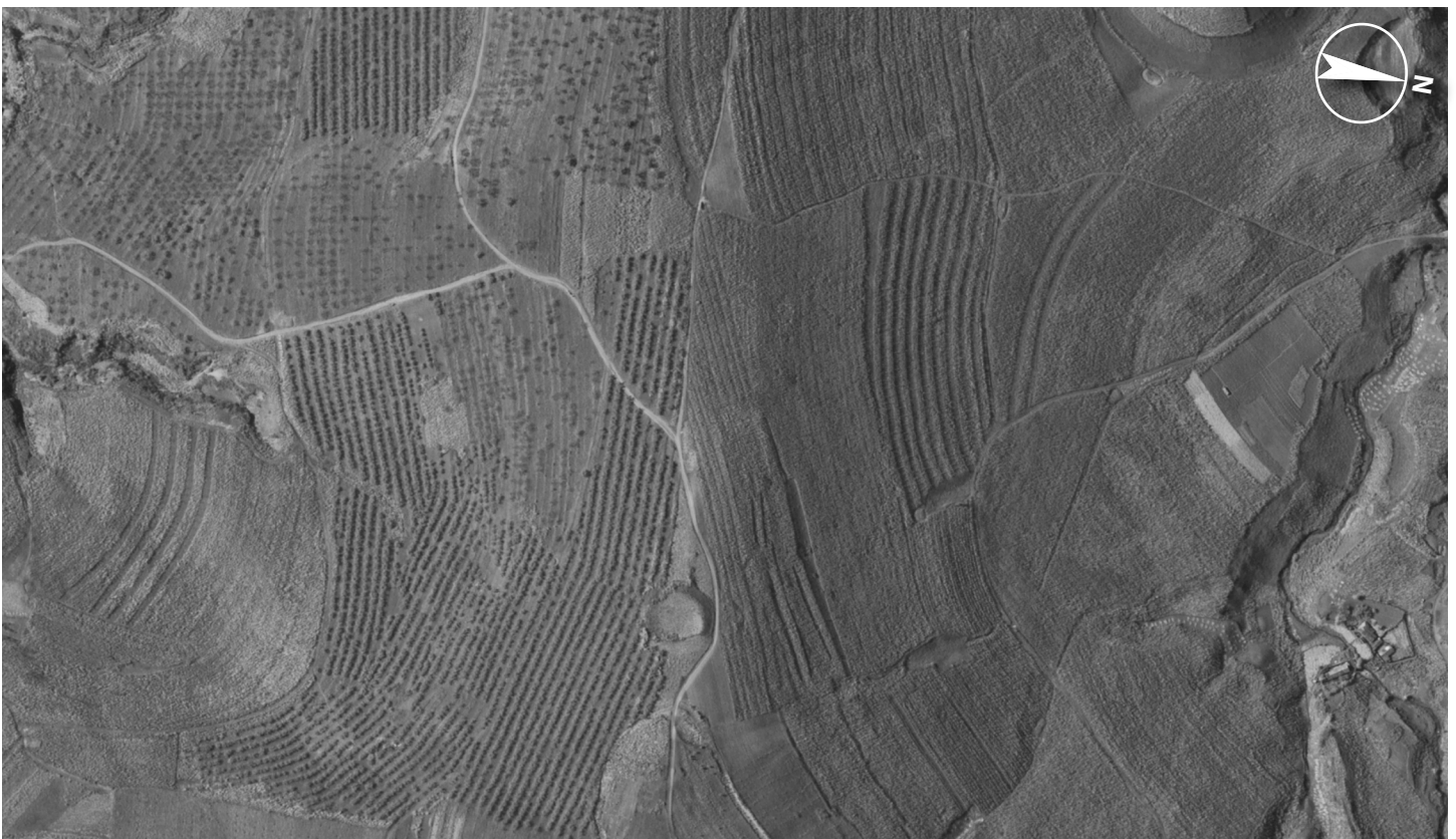
DigitalGlobe Panchromatic Image, October 7, 2012, 42 30 06 N, 129 48 05 E