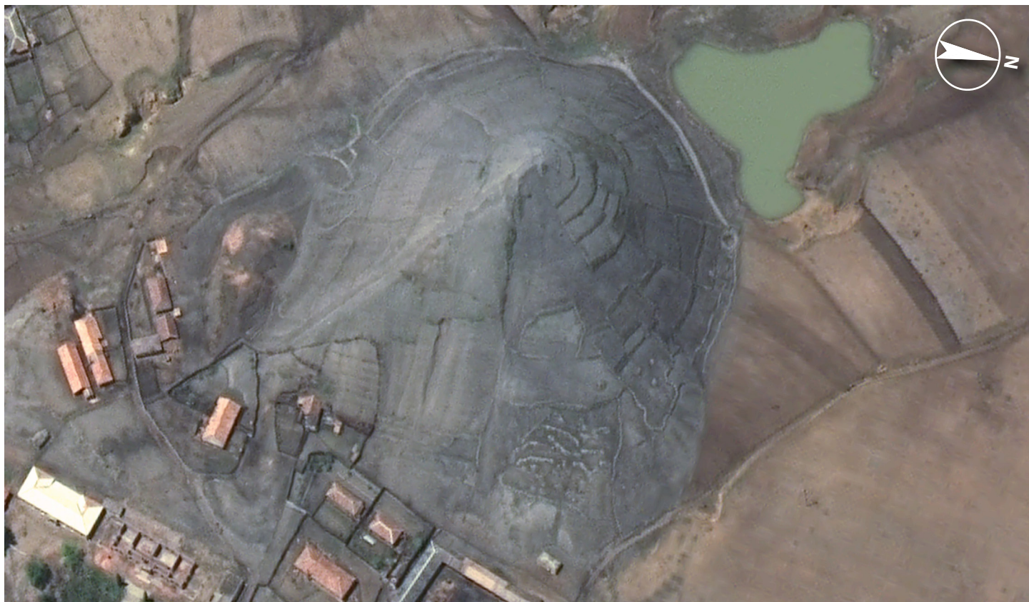
DigitalGlobe Natural Color Image, May 21, 2011, 42 29 48 N, 129 47 24 E

In the 2011 image, the mine tailings pile in northwest Kungsim-dong has a perimeter of approximately 700 meters. In 2012, it is approximately 711 meters, indicating no apparent change.