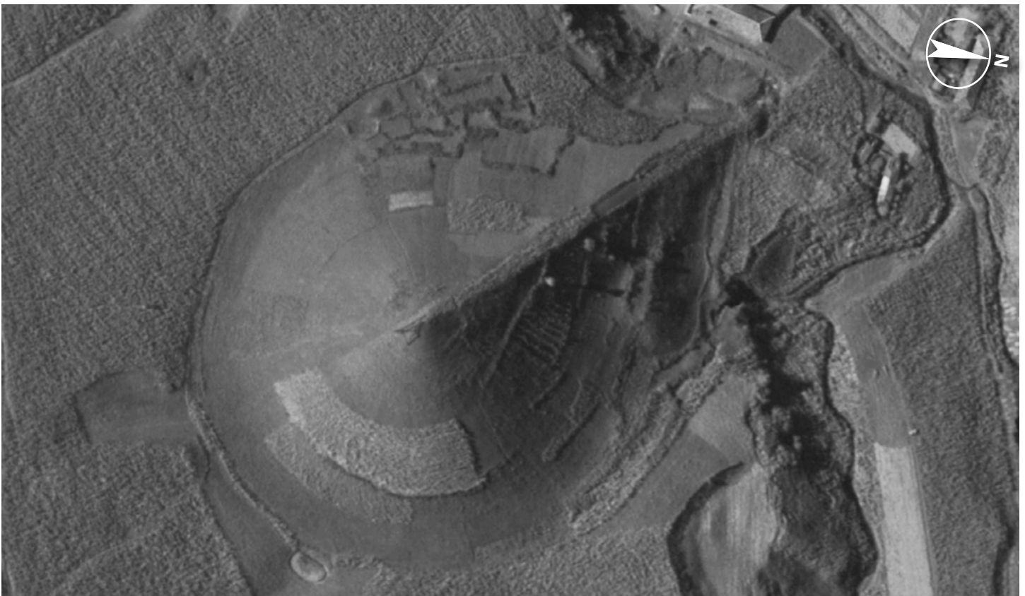
Panchromatic Image, October 7, 2012, 42 30 09 N, 129 47 59 E