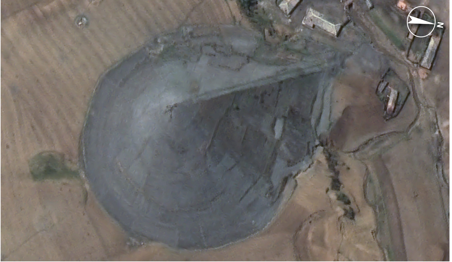
Natural Color Image, May 21, 2011, 42 30 09 N, 129 47 59 E

There is no change in the mine tailings pile in northeast Kungsimjup'o-dong. In 2011, its perimeter is approximately 603 meters. In 2012, it is approximately 610 meters.