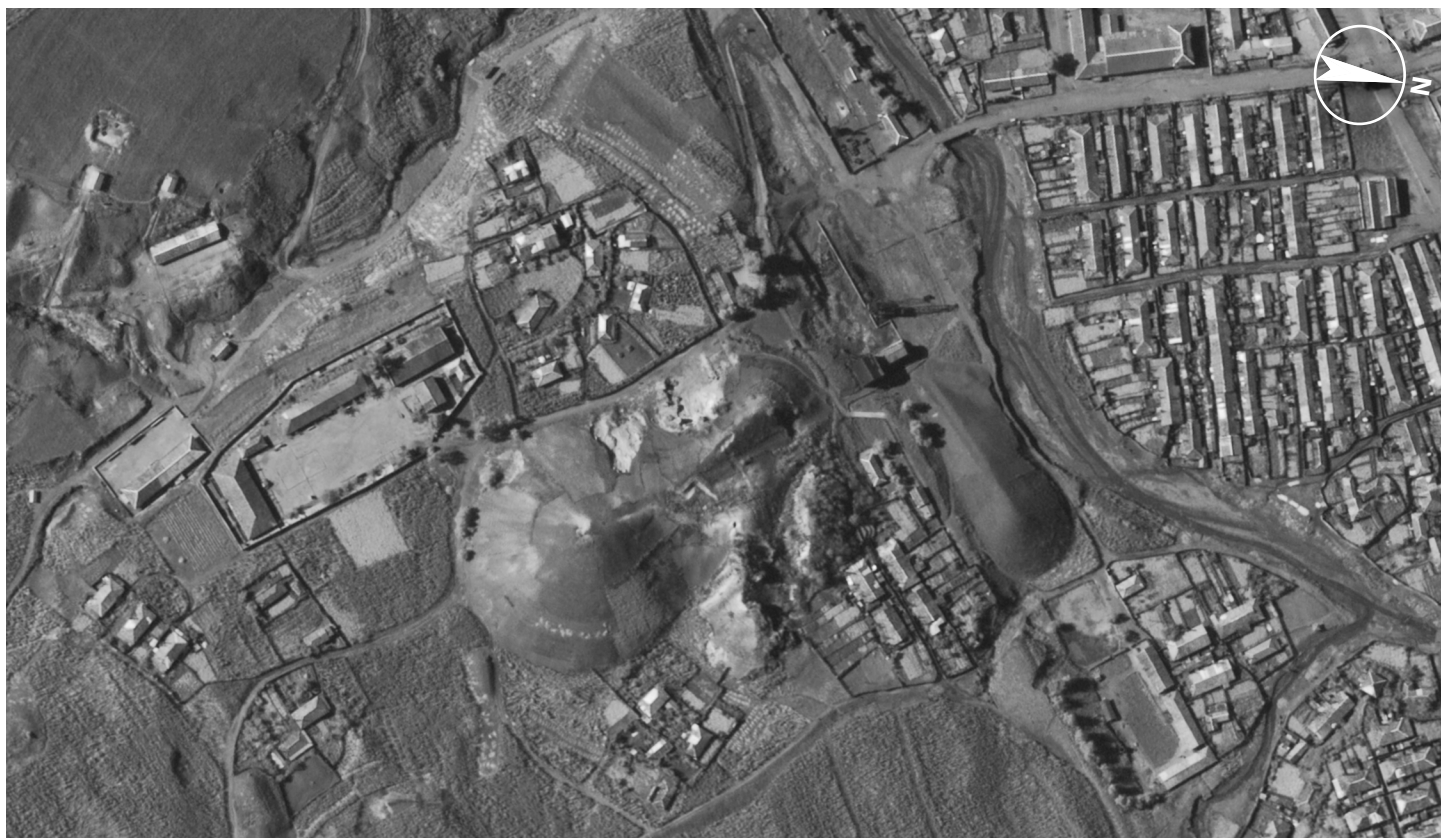
Panchromatic Image, October 7, 2012, 42 29 28 N, 129 47 32 E