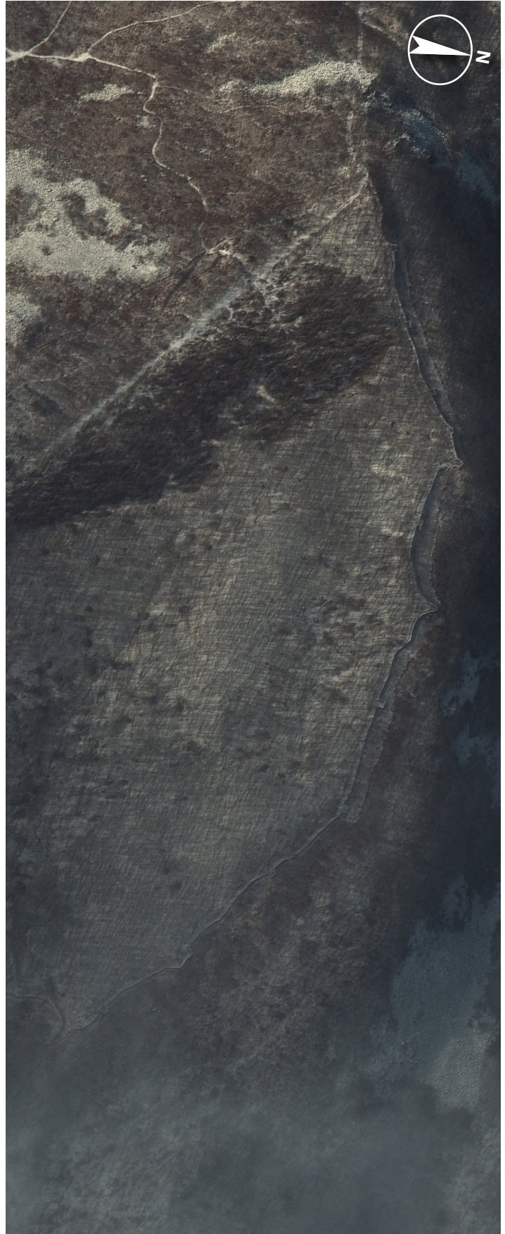
November 26, 2012, 42 27 50 N, 129 53 59 E