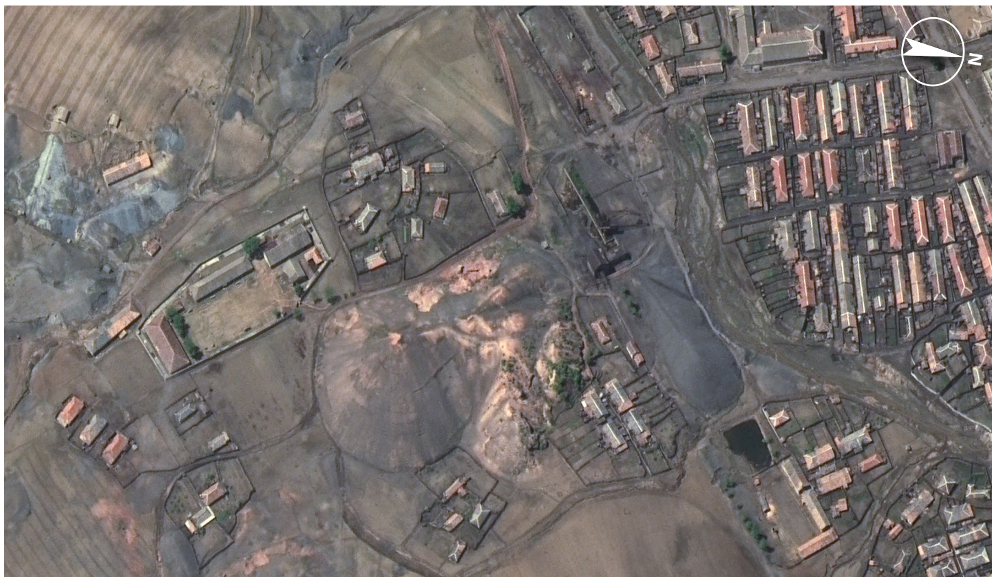
DigitalGlobe Natural Color Image, May 21, 2011, 42 29 28 N, 129 47 32 E

In Kungsim-dong, the horizontal mine shaft visible in 2011 is still present in 2012. The tailings pile's perimeter measures approximately 300 meters in 2011 and approximately 293 meters in 2012, indicating no significant change.