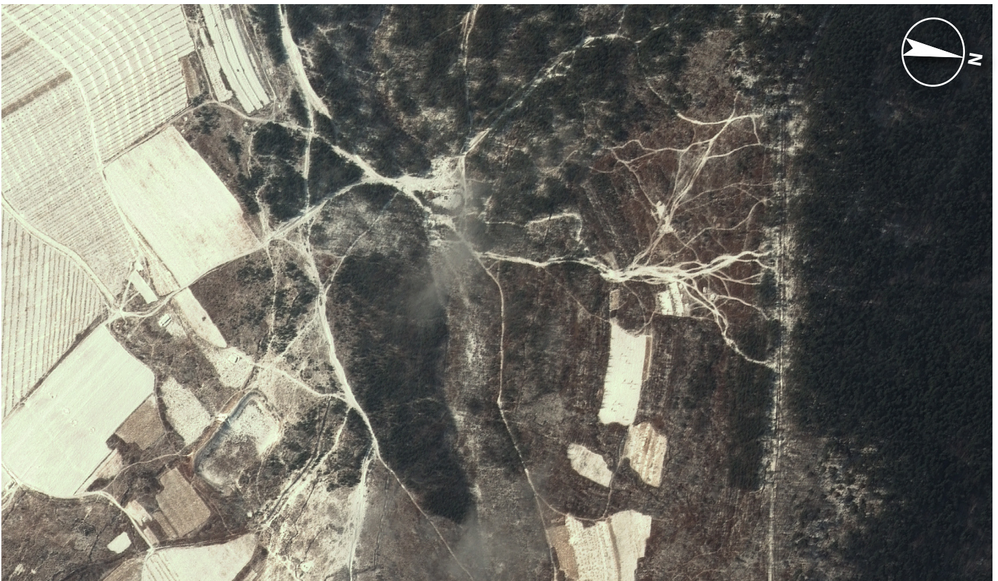
Natural Color Image, November 26, 2012, 42 27 37 N, 129 53 11 E