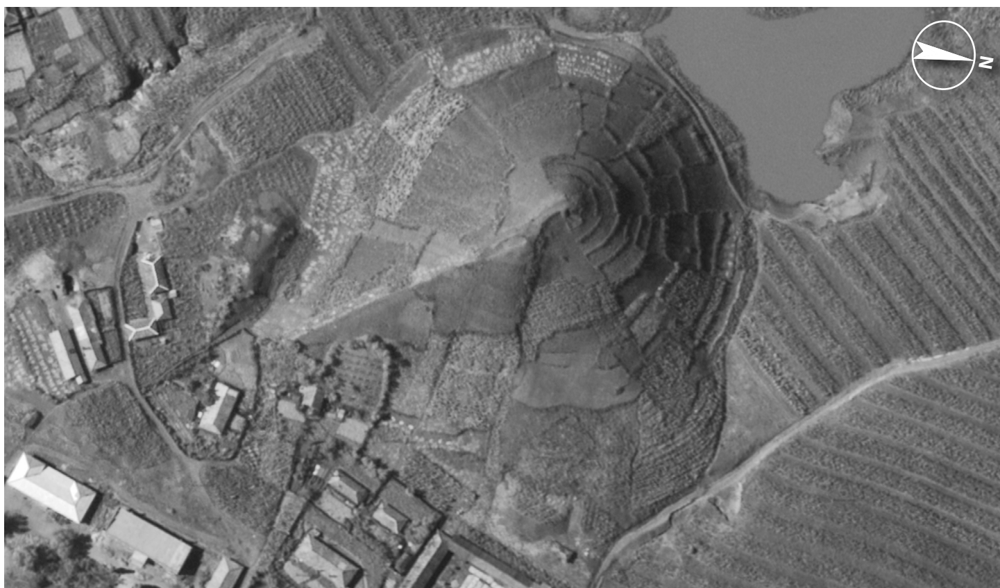
DigitalGlobe Panchromatic Image, October 7, 2012, 42 29 48 N, 129 47 24 E