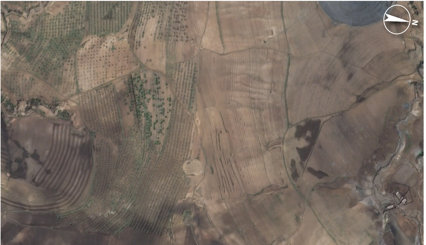
Natural Color Image, May 21, 2011, 42 30 06 N, 129 48 05 E

High levels of agricultural production are visible in northwest Kungsim-dong. Although seasonal differences are evident between the two images, there is no significant change to agricultural patterns.