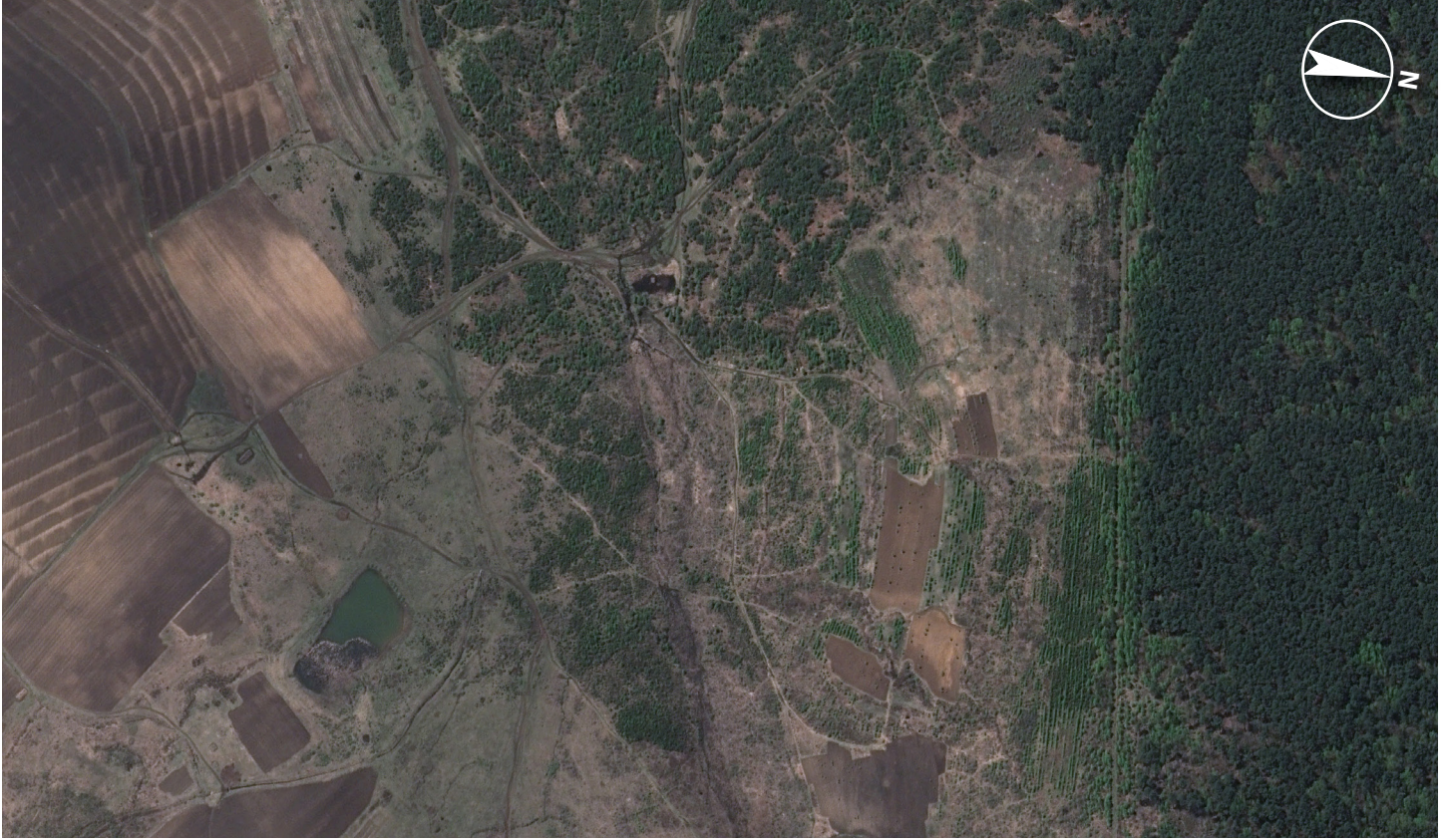
Natural Color Image, May 21, 2011, 42 27 37 N, 129 53 11 E

The paths between the camp's southern perimeter and nearby fields 13 kilometers south of Chungbong-dong are more distinct in the 2012 image because of snow.