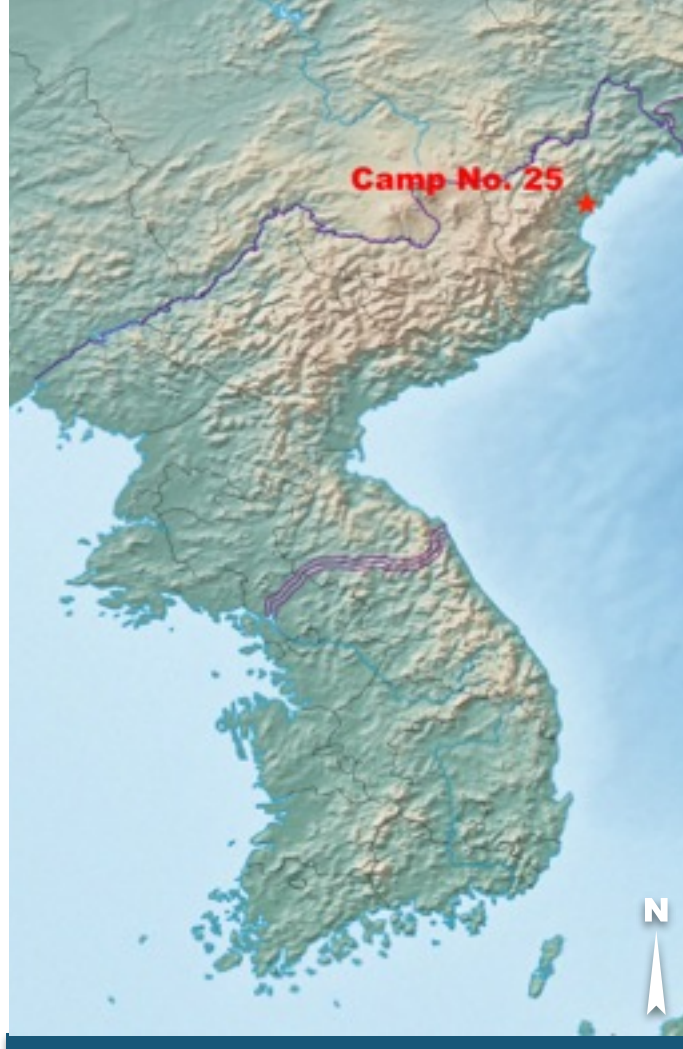
Figure 1, Camp No. 25 Location Map

On the cover: North Korea's Political Prisoner Camp No. 25, March 22, 2014.