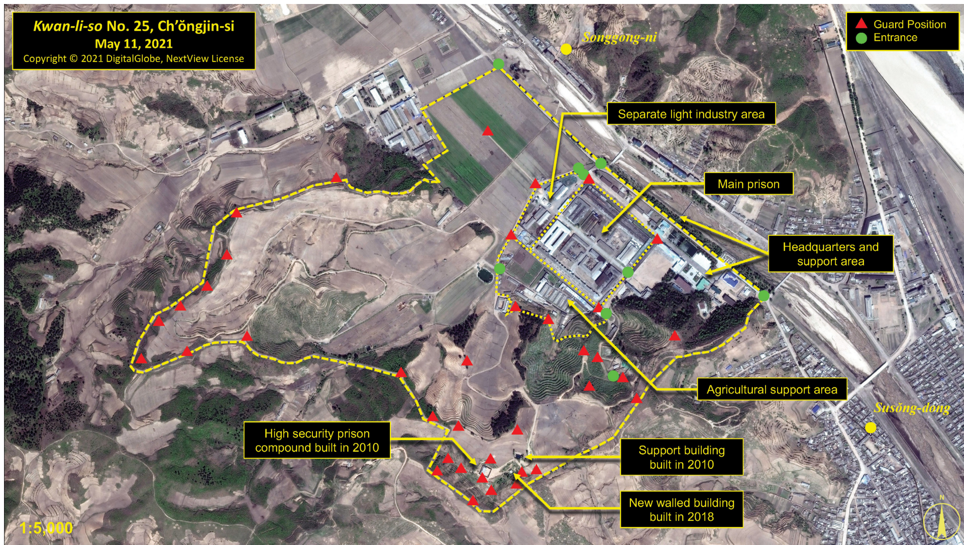
Overview of Kwan-li-so No. 25.