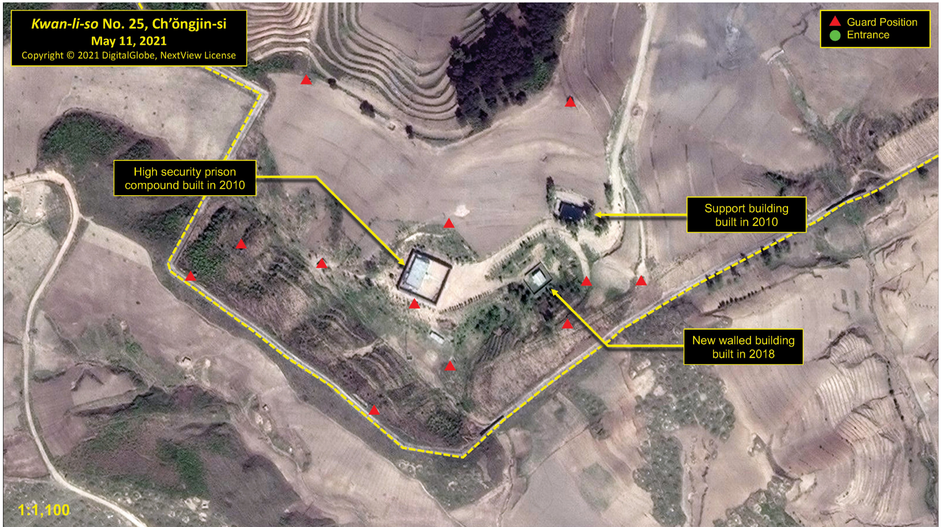
Secure compound in southeast corner of Kwan-li-so No. 25.