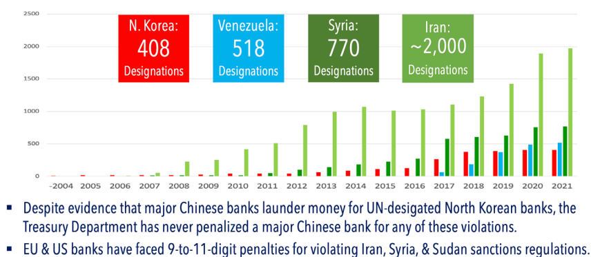
Cumulative Sanctions Designations by Country: 2005-2021

A former U.S. Representative to the UN Panel of Experts testified similarly, as follows: