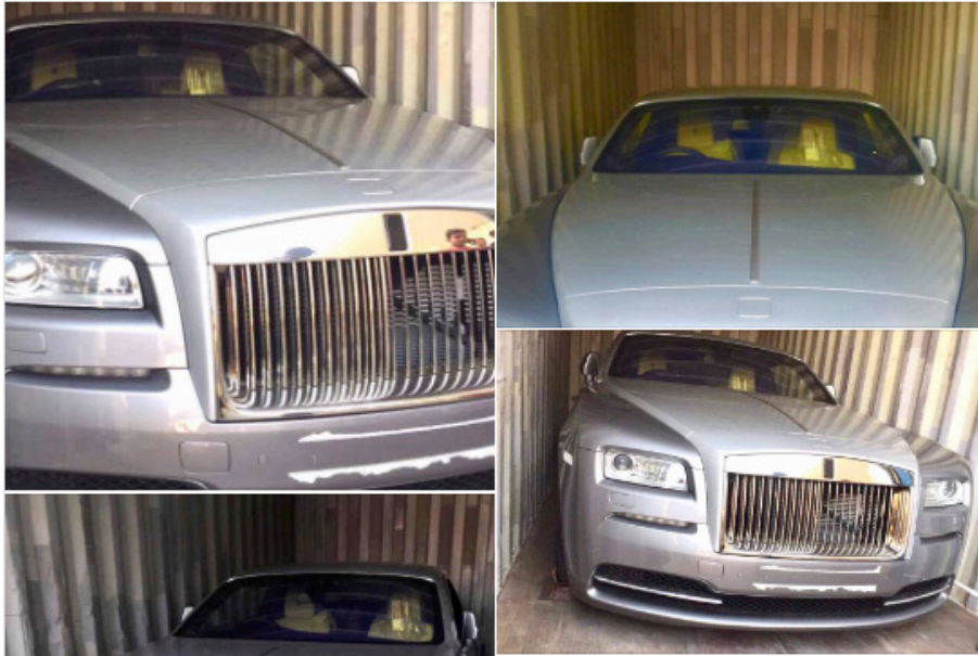
Rolls-Royce Ghost seized by Bangladeshi Customs from North Korean diplomat Han Son in 2017. 71