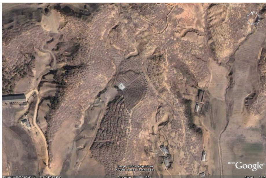
Satellite imagery of the hills around Hamheung, North Korea