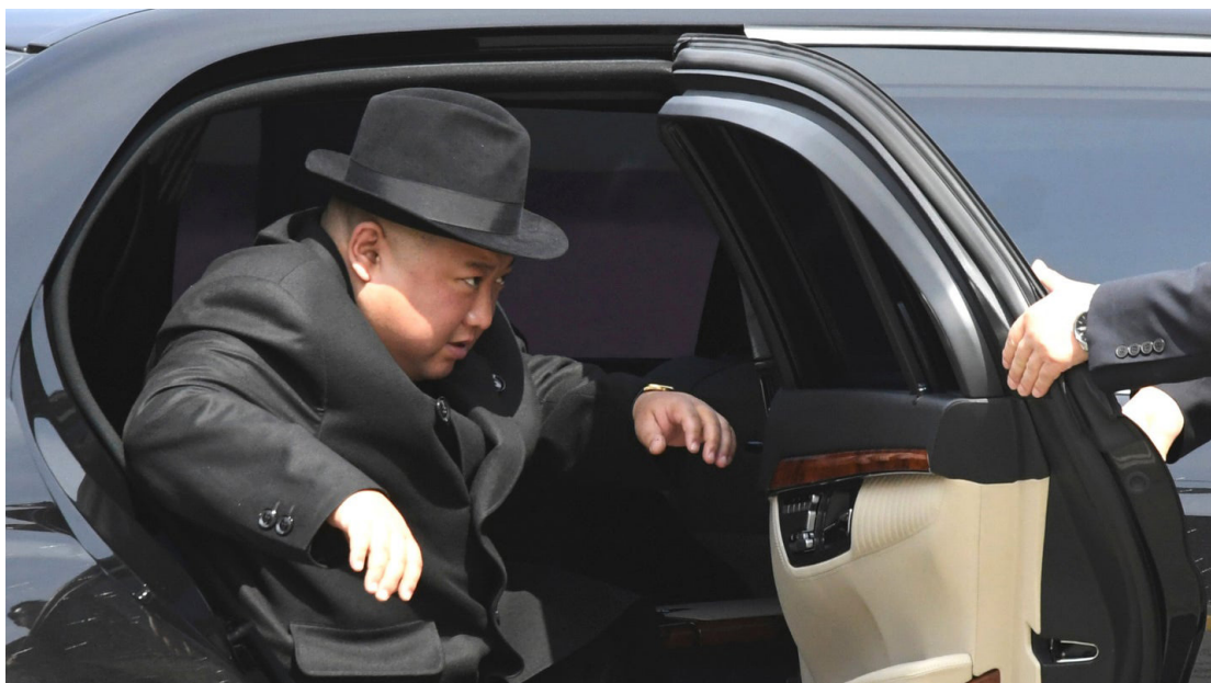
Kim Jong-un emerges from a Mercedes-Benz limousine in 2019. 72

At his June 2018 Singapore summit with President Trump, Kim Jong-un and his entourage rode in at least two of the Mercedes-Benz limousines that the UN Panel of Experts had observed at previous parades in Pyongyang, each worth $500,000. 73 That same month, Pyongyang imported two more Mercedes-Benz limousines from Germany, shipped them to Italy to be armored, and in August, transshipped them through Japan and South Korea to North Korea. 74 Kim and his entourage rode in these limousines when they arrived at the 2019 Hanoi summit. 75