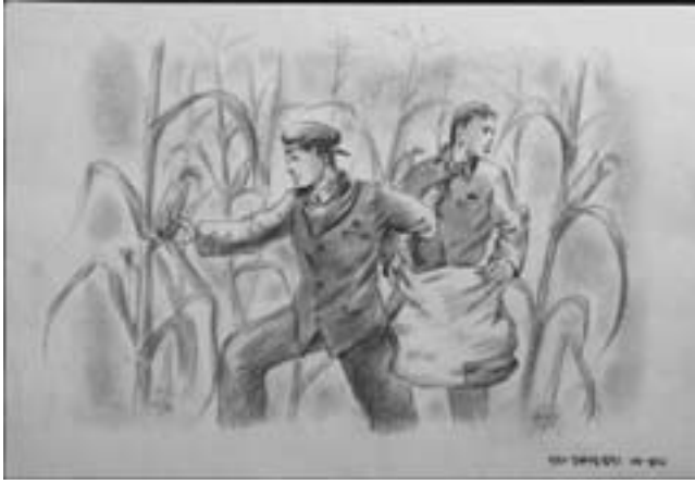
Attacking a Corn Field (Elementary and Middle School Years)

Yet despite the dangers and difficulties they face in their present situation, the defectors are able to find at least some sources of hope as well as reasons to feel that they are working toward achieving their goals; answers to these questions, while also reflecting adverse circumstances, for most respondents were at least somewhat more positive than those related to anxiety.