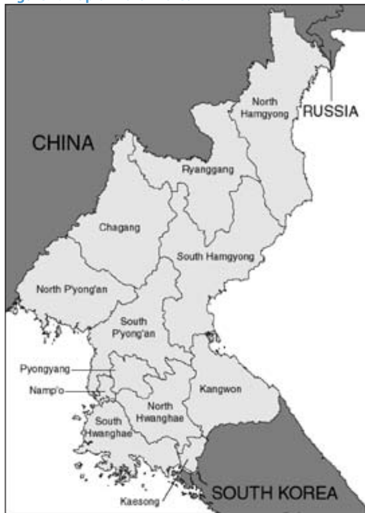
Figure 1. Map of North Korea