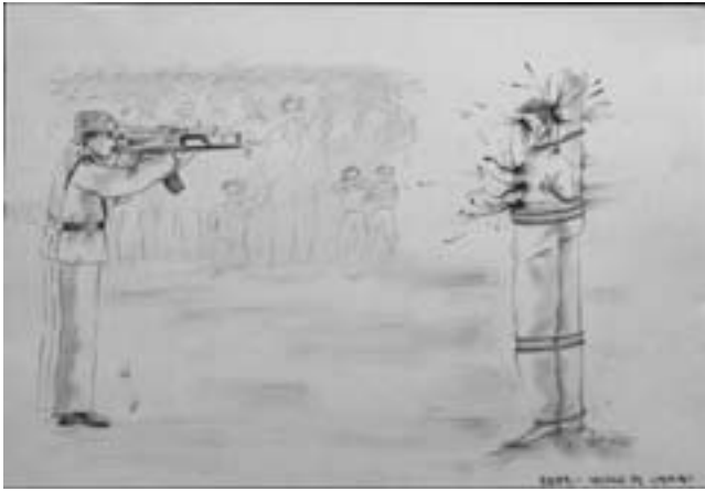
Witnessing Public Execution (Elementary School 2nd Grade-Age 9)

or physical abuse or assault, including sexual assault. Trauma involves severe and possibly unmanageable stress reactions that can cause a unique kind of physical/emotional shock that escalates the “fight-flight” stress response (feeling angry or scared) into “super-stress” (feeling terrified, stunned, horrified, like your life is passing before your eyes, or so overwhelmed you blank out).