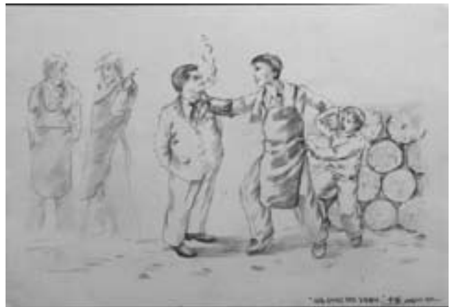
“Working like a dog and receiving little pay. There’s nobody to whom I can appeal.” (China)

Articles 1 and 33 together make clear that a state party to the Convention cannot send a refugee back to a place where he or she would likely be persecuted. Implicit in the Convention—the strict Article 33 prohibition read together with the multi-pronged Article 1 refugee definition—is a requirement that states take appropriate steps to determine whether an individual is a refugee before sending him or her back to possible persecution. The Convention itself is silent on the type of refugee identification procedures that will suffice.