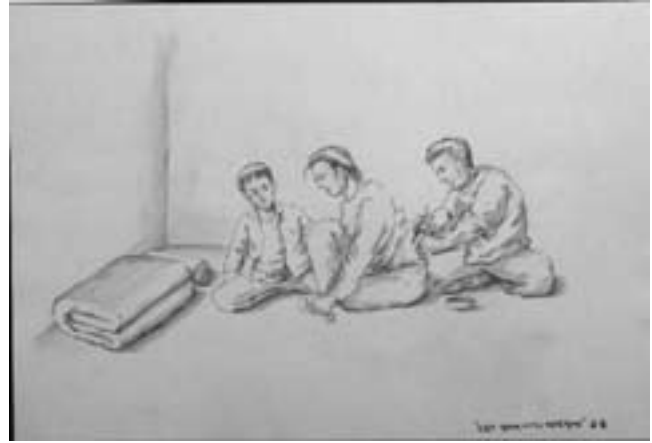
“Nursing my mother at home. We didn’t have money to cover the medical expenses.” (China)

However, the number of refugees in South Korea, and particularly the number of educated refugees, remains too small to play such a role. Therefore, it makes sense to consider a substantial increase in the number of refugees. The current level, which has been stable for the last five years, is about 1,500 new refugees annually. This number is neither sufficient to have a substantial impact on the country, nor to exercise any influence over the course of unification were it to come. The refugee community will start having some impact only if the annual number of newcomers reaches the level of approximately 5,000 to 10,000 a year, enough to generate a critical mass in a matter of few years. After all, this is still well below the level Germany handled on a regular basis for decades, and without too many difficulties.