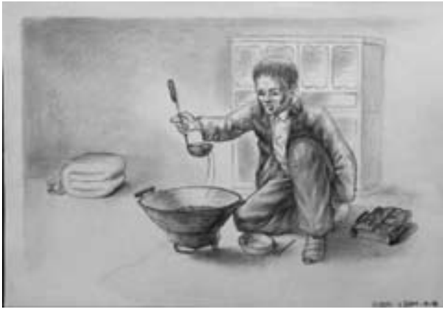
Making Porridge with a Few Noodles

Persons determined to be refugees based on likely punishment if returned home are known as refugees “ sur place .” The UNHCR Handbook states: