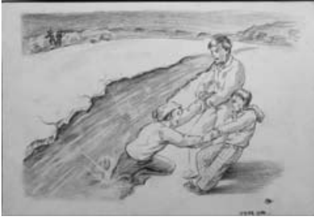
Crossing the Tumen River

This statement reiterated the traditional position of the South Korean government that has not changed since 1948. However, the Ministry of Unification immediately “clarified” this ministerial statement. A senior official at the Unification Ministry explained that the minister’s remarks refer to a “group of North Koreans who had wrapped up all the necessary procedures for entry into South Korea with the nation’s overseas embassies.” Such a “clarification” effectively rendered the minister’s statement meaningless, since it excluded virtually all of the refugees in China, none of whom have valid passports, and therefore are incapable of “wrap[ping] up all the necessary procedures for entry into South Korea with the nation’s overseas embassies.” 11 It is remarkable that the Korea Times daily, when reporting these developments, simultaneously ran two articles under contradictory headings: one stated “Korea to Accept All NK Refugees” while another said “Seoul Lacks Practical Means