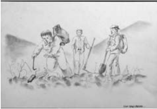
Chasing Rats with My Friends During Our Vacation

Rights: The Politics of Famine in North Korea”), it is still likely that many North Koreans who managed to escape the country would have strong claims to refugee status.