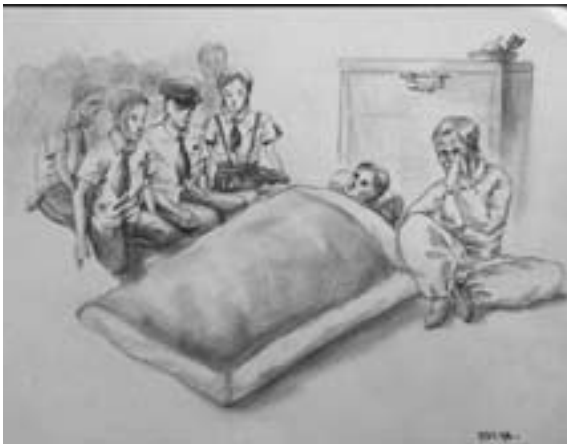
Death of a Friend (died after swallowing almonds)

Yet, not only does China take no steps of its own to assess refugee status, it does not permit UNHCR access to the China-North Korea border area to assess the status of North Koreans. Beginning in 1997, UNHCR conducted regular fact-finding missions to the border and noted to Chinese officials its concern regarding North Koreans there. During such a mission in May 1999, UNHCR determined that some North Koreans were “persons of concern” (POCS) to UNHCR (UNHCR would have called them refugees if not for certain factors, including the dual nationality issue discussed below). China officially reprimanded UNHCR for this action and has since denied the agency permission to travel to the border. This action is in clear violation of the Refugee Convention, which requires parties to cooperate with UNHCR in its supervision of the application of the Convention. Some advocates argue that UNHCR has failed to sufficiently pressure China since 1999 to reverse this situation. Others doubt that such pressure would be successful and believe that it would further erode relations between UNHCR and China.