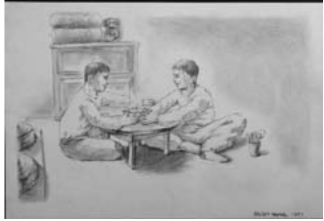
Fight with My Brother Over a Bowl of Porridge

Finally, when asked who received food aid, 94 percent of the refugees who were aware of the program believed that it went to the military and 28 percent said that it went to government officials; less than 3 percent said that it went to common citizens or others. Again, this does not prove that the aid was diverted to the military and officials. But at a minimum, the responses attest not only to the perceived power and centrality of the military in North Korean life but also to the wider control over information and resources on the part of the regime. In the context of a massive, decade-long multinational humanitarian aid program, North Korean refugees exhibit a significant lack of awareness of the overall aid effort. Their overwhelming impression is that the primary beneficiaries of the aid effort were the military. These findings ought to give significant pause to the humanitarian community.