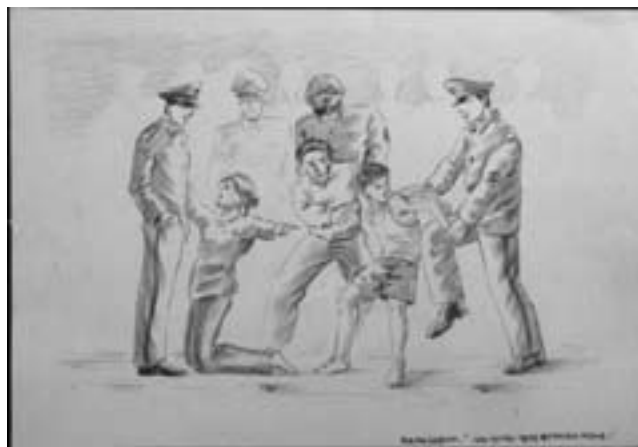
To the Chinese Security Service Officers...“Take us, but please let our son go.”

another pilot defector—Yi Ung-pyŏng in 1983. This change no doubt reflects not only the diminishing military value of a MIG-19 fighter jet, but also the diminishing political value of defectors. Former Korean Workers' Party secretary Hwang Chang-yŏp, by far the highest level North Korean defector, was paid the smaller but still significant sum of 250 million won in 1997 ( Munhwa Ilbo , October 1, 1997, 2). The 250 million won is the largest sum theoretically payable as a special prize under the 1997 law. If managed well and used with reason and moderation, this amount could insure a life-long, lower-middle-class lifestyle, but hardly more. However, these figures are far from typical: even in the mid-1990s, 95 percent of the defectors failed to receive any special prize at all, and high prizes were paid only to a handful of the most important refugees (Kim 1996, 71).